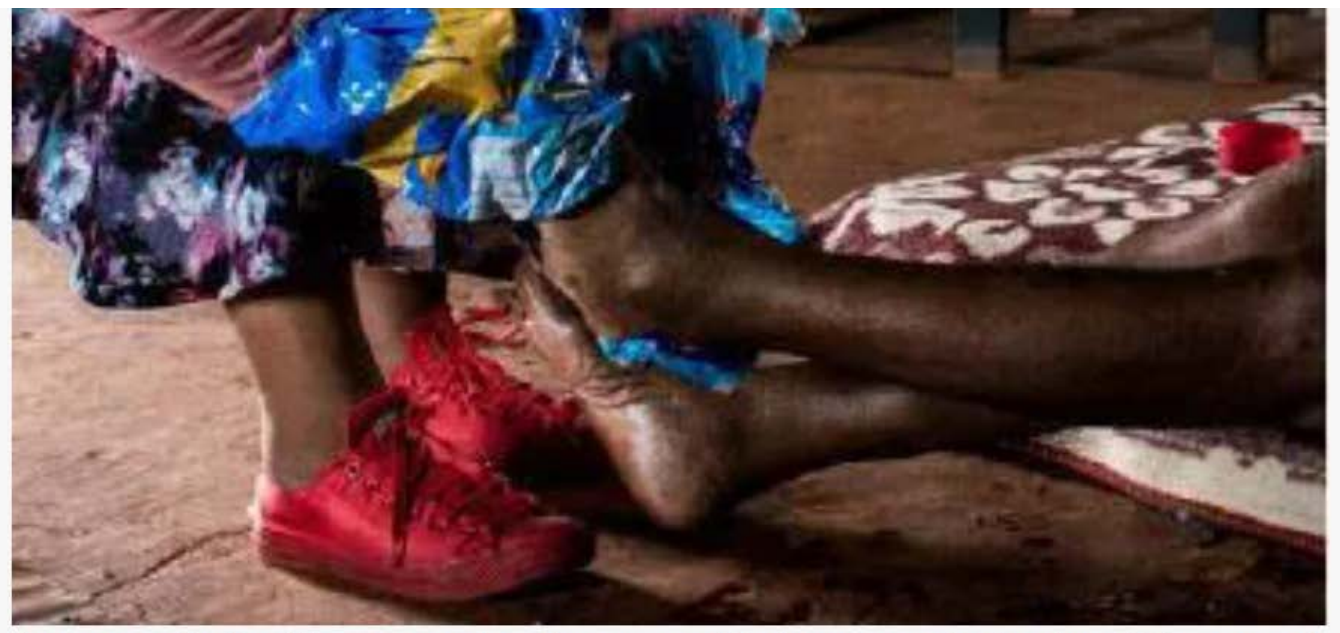
A community health care worker cleans an elderly woman during her visits around the community of Sweet Waters in KwaZulu-Natal.